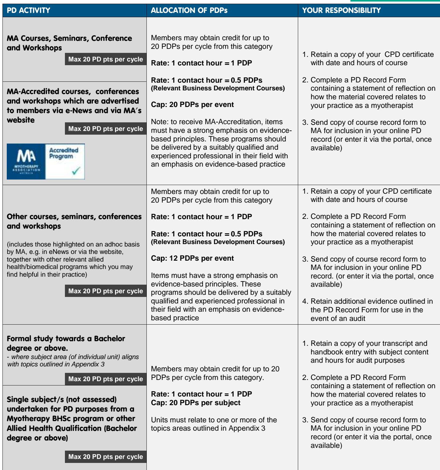
Table 1 – Guidelines for Documenting Formal PD Tasks

20 PDPs required per cycle via formal and/or informal PD